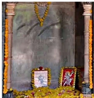
Adorned with flowers and reverence, Goddess Vagdevi, stands as a symbol of civilizational continuity and spiritual devotion

The dual-use agreement that had controlled the complex for more than 20 years is essentially terminated by this.