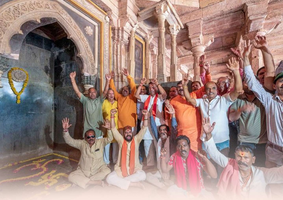
Devotees offer prayers inside the historic Bhojshala complex in Dhar, Madhya Pradesh, signifying the deep-rooted connection to Maa Saraswati Vatika