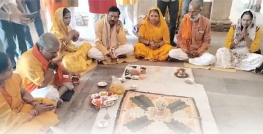
Medieval Bhojshala complex: A moment of spiritual harmony as devotees gathered to perform daily traditional Hindu ritual and prayer ceremony

The judicial trajectory of the Bhojshala matter illustrates a careful migration from administrative compromise to evidentiary adjudication. The Division Bench did not rest its conclusion on faith or tradition alone; it built its findings on three converging streams of proof, namely the ASI's court-monitored scientific survey, historical literature establishing the Paramara-era Sanskrit centre associated with Raja Bhoj, and the recorded continuity of Hindu worship across centuries of administrative shifts. The Court's express observation that "archaeology being a science, the findings emerging from scientific studies could be relied upon" signals a maturing jurisprudence on the use of expert evidence in disputes over religious heritage. Importantly, the Court engaged squarely with the Muslim side's structured objections led by Senior Advocate Salman Khurshid, on title, on juristic personality, on survey methodology, and on the absence of carbon dating, and chose to test those objections against the documentary and archaeological record rather than against the 2003 administrative status quo.