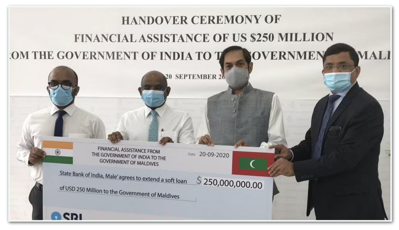
India extended a soft loan of $250 million to the Maldivian government, offering budgetary support to help alleviate the economic consequences of the Covid-19 pandemic in 2020.

Economic fabric binding India and Maldives has been traditionally strong, with projects such as the Greater Male Project underscoring India's commitment to the Maldivian economy. India's investments and infrastructural projects have often been synonymous with the economic development narratives of the Maldives. President-elect Muizzu, while recognising these valuable contributions, seems poised to steer the Maldivian economic ship towards more diversified shores. His intentions to diversify the Maldives economic partners, while a strategic move to shield the nation from over-reliance on a singular partner, is also an implicit indication of broadening economic horizons beyond India. This approach, if pursued, could reshape the Maldivian economic landscape, bringing with it a fresh set of opportunities and challenges. The task for Muizzu will be to ensure that in seeking new partnerships, the foundational economic ties with India, cultivated over decades, are not undermined.