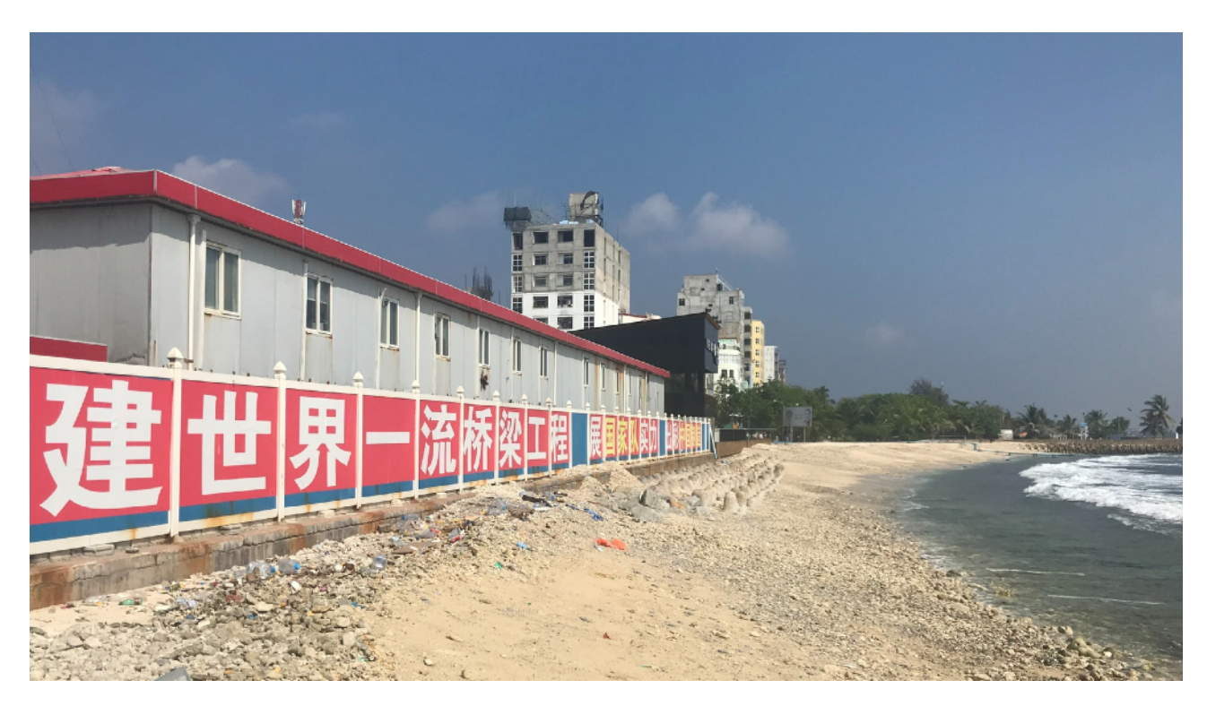
The Maldives has secured significant loans from China for various infrastructure endeavours, one of which includes a bridge linking the capital, Male, to the nation's international airport situated on a neighbouring island.

of engagement to avoid similar pitfalls. While Muizzu's aspiration for diversification is understandable from an economic resilience standpoint of view, it's vital that this doesn't translate into a dilution of the historically warm and multifaceted relationship with India. After all, India's proximity, both geographically and culturally, combined with its consistent support makes it an indispensable ally for the Maldives. As Muizzu navigates these economic waters, striking a balance will be crucial. While diversification is a worthy goal, maintaining and nurturing the foundational ties with India alongside carefully vetted engagements with new partners, will determine stability and prosperity of Maldivian economic landscape.