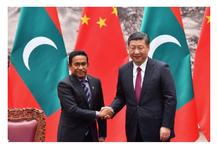
During President Yameen's three-day state visit to China in 2017, the Sino-Maldives free trade agreement was one of 12 bilateral deals signed.

are symbolic of this deepening economic relation. Unlike India's democratic and human rights emphasis, China offers its investments without these 'strings.' This approach, especially during the tenure of leaders like Yameen, made Chinese investments attractive. As, Maldives is integral to China's 'String of Pearls' strategy, aimed at increasing its influence in the Indian Ocean Region. China's infrastructural investments in the Maldives are not just economic but have significant geostrategic implications. In the light of these historical dynamics, President-