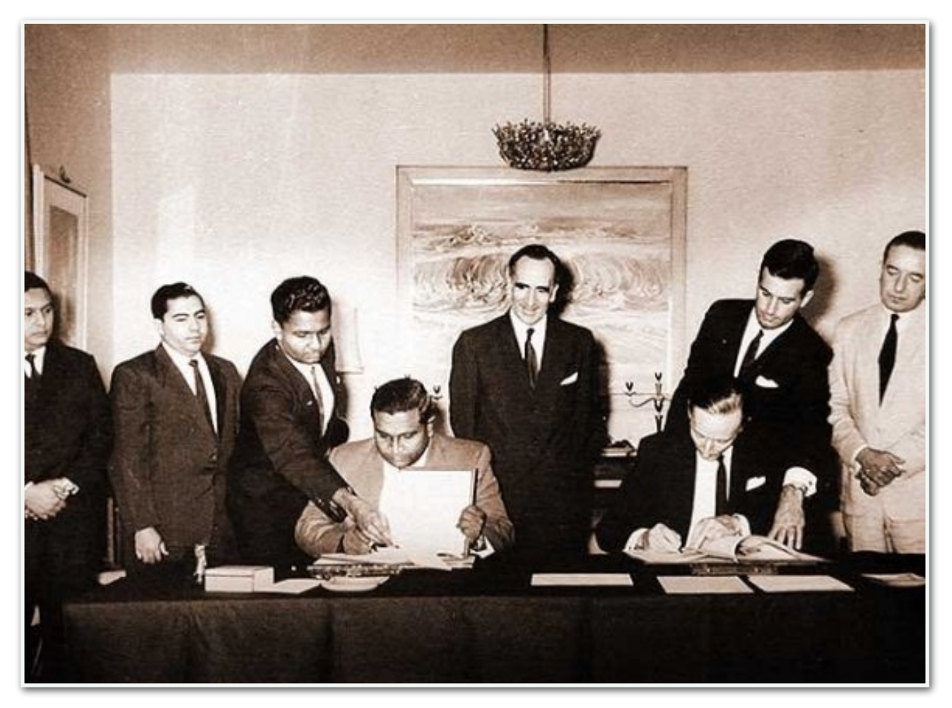
Signing of the Maldivian Declaration of Independence in 1965.

The Maldives, as a strategic archipelago in the Indian Ocean, has seen its foreign relations heavily influenced by its larger neighbours, primarily India, and in recent decades, China. The historical dynamics of these relationships offer insight into the evolving geopolitical landscape.