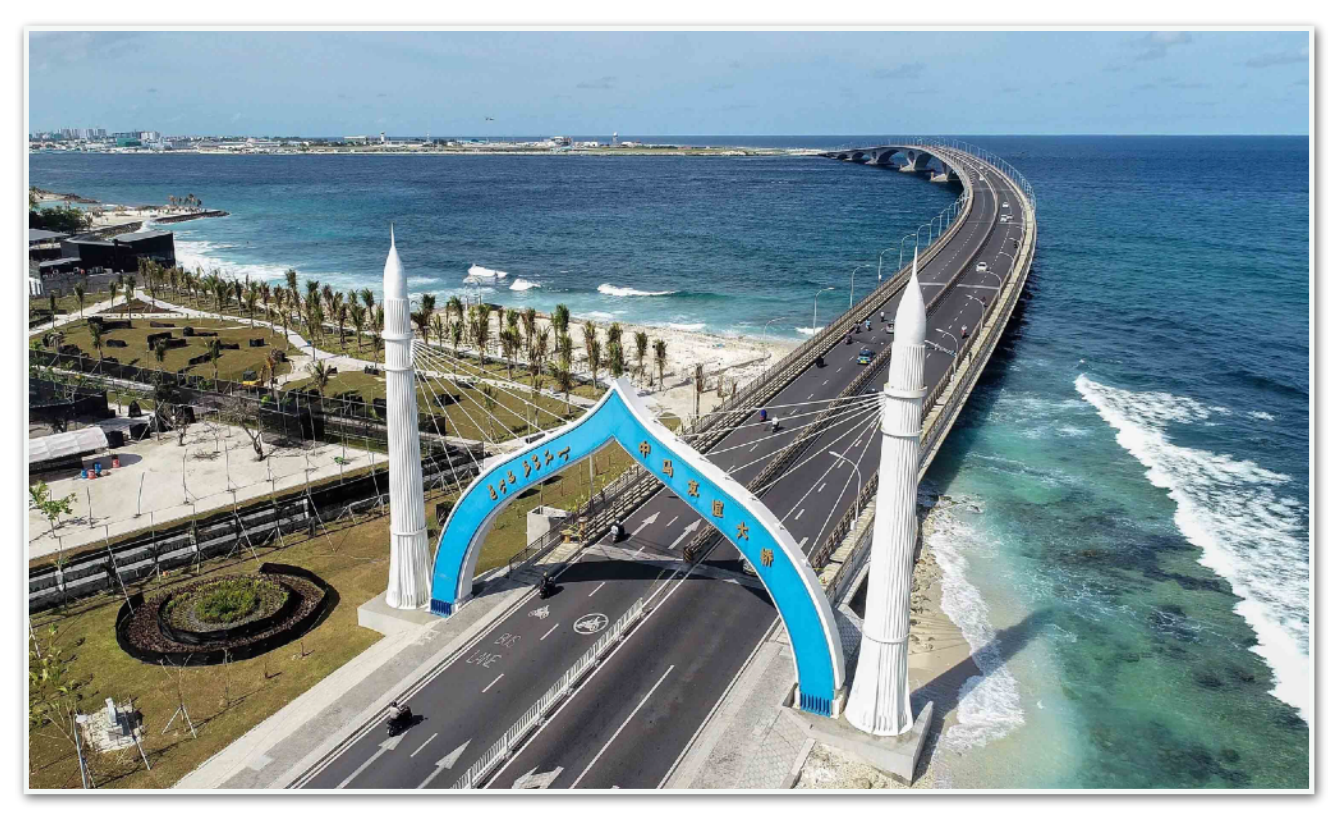
Finished in 2018, the China-Maldives Friendship Bridge stands as the hallmark initiative of China's infrastructure surge in the Maldives.

Mohamed Muizzu's foreign policy orientation highlights a significant re-evaluation of the Maldive's traditional diplomatic leanings. India's ties with the Maldives have deep historical roots. The two nations share cultural, economic, and strategic ties that span decades. From recognising the Maldives independence in 1965 to extending consistent aid, India has been a steadfast ally. India's geographical proximity to the Maldives has positioned it as a primary responder in times of crisis, exemplified by interventions like 'Operation Cactus' in 1988, where India thwarted a coup attempt in the Maldives.