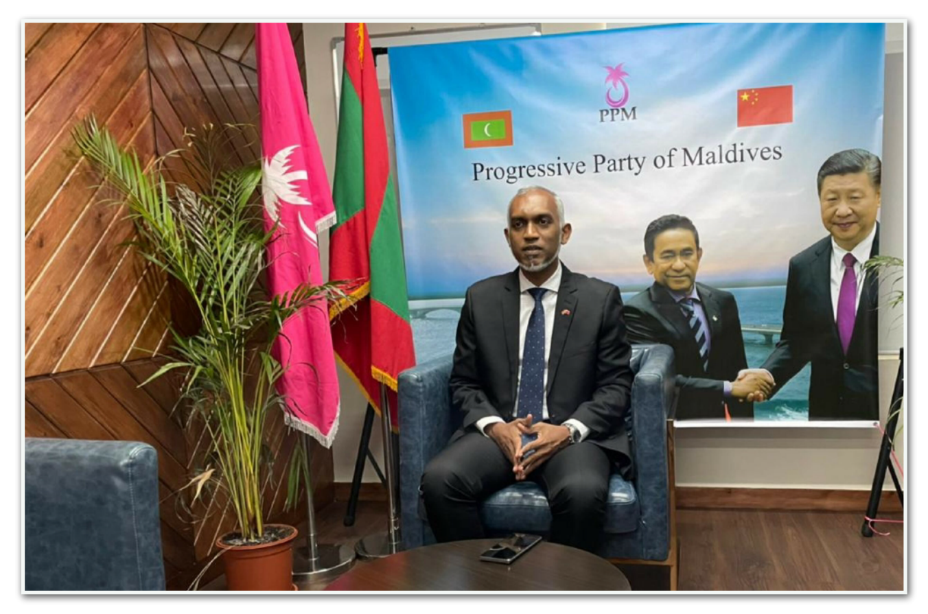
Mohamed Muizzu participating in the "CPC and World Political Parties Summit" held on 6 July 2021

later as Mayor were cordial and focused on bilateral cooperation. However, they were also marked by an undercurrent of seeking a balanced foreign policy, which in many interpretations meant reducing reliance on India.