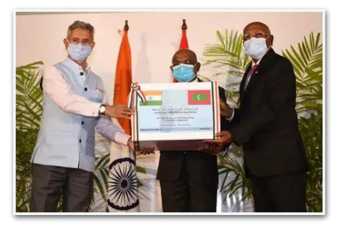
Maldives became the first recipient of Covid-19 vaccines from India, having been generously given 100,000 doses in January 2021.

Association for Regional Cooperation (SAARC) and as signatories to the South Asia Free Trade Agreement. On the maritime front, the waters have mostly been calm. In 1976, both countries set a benchmark for peaceful regional cooperation by amicably delineating their maritime boundaries. A brief ripple in this calm sea occurred in 1982 over the Minicoy Island. However, the Maldivian leadership's swift and unequivocal affirmation of not laying claim to the Indian territory showcased the depth of trust between the two nations. The Maldive's strategic