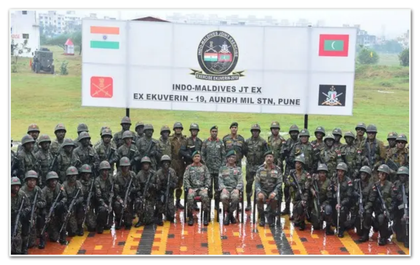
11th edition of Exercise EKUVERIN-21 between India and Maldives, held at Kadhdhoo Island, Maldives.

The defense bond between India and the Maldives is built on a foundation of decades of mutual trust, cooperation, and shared strategic interests. This relationship has been punctuated by joint military drills that have not only strengthened operational coordination but have also underscored the depth of mutual trust between the two nations. Deepening this bond, India has consistently assisted the Maldives in augmenting its maritime surveillance capabilities. This includes the notable donation of patrol vessels to the Maldives National Defence Force's Coast Guard and the pivotal role India played in establishing a state-of-the-art coastal radar system in the region. India's deployment of defense assets, such as helicopters and a Dornier aircraft, further emphasise its unwavering commitment to the Maldives security and sovereignty.